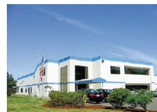
JAMCO AMERICA, INC.