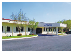
JAMCO PHILIPPINES, INC.