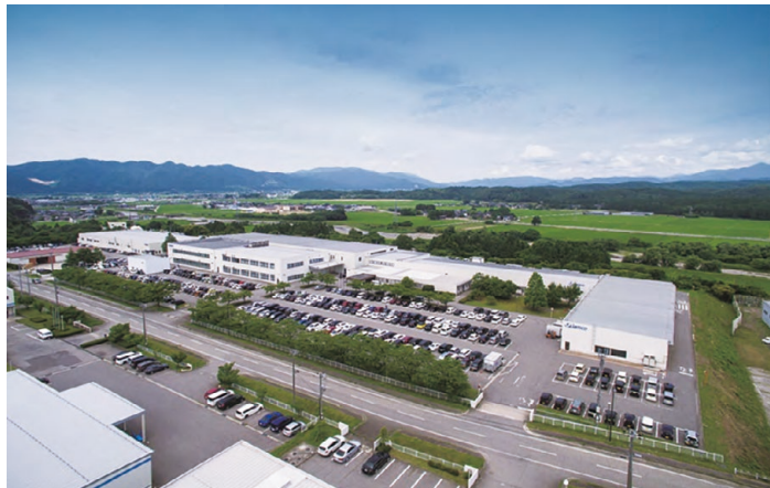
JAMCO Aircraft Interiors Corporation Niigata Factory

Company name JAMCO Corporation Head Office 1-100 Takamatsu-cho, Tachikawa, Tokyo, Japan Established September 1, 1955: C. Itoh Aircraft Maintenance and Engineering Co., Ltd. established June 16, 1970: Corporate name changed to New Japan Aircraft Maintenance Co., Ltd. June 29, 1988: Corporate name changed to JAMCO Corporation Capital 5,359,893 thousand yen Main shareholders ITOCHU Corporation ANA HOLDINGS INC. Showa Aircraft Industry Co., Ltd. Employees 2,692 (JAMCO Corporation: 1,059)