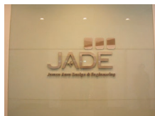
JADE ENGINEERING PTE LTD.